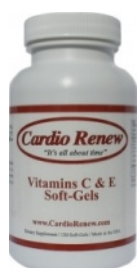
Cardio Renew C & E Soft-Gels